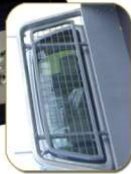
Mesh Cab Protector