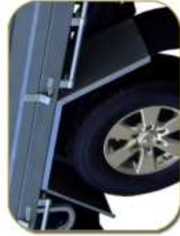
Full Steel Guards