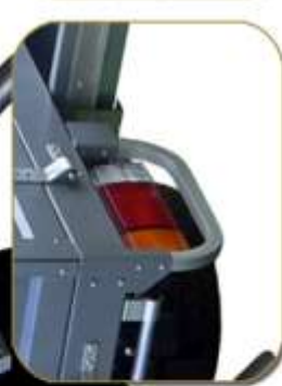
Tail Light Protectors